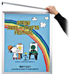
3/4" SLIM DESIGN

FOR CURRENT PRICING, VISIT THE ID # LISTED ABOVE FREE SHIPPING