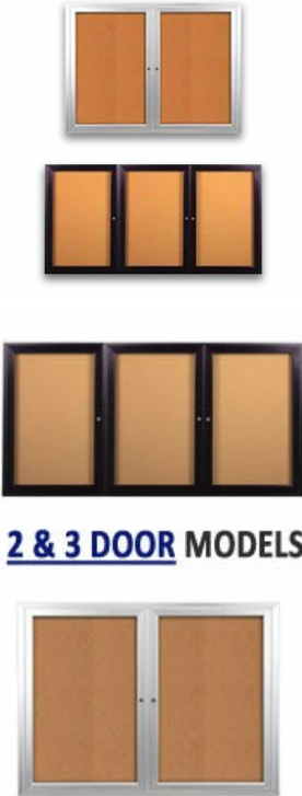
2 & 3 DOOR MODELS