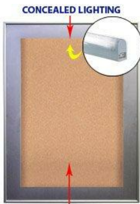
(6) Optional FABRIC COLORS over Natural Tan Cork Board