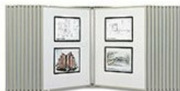
SWINGING PANELS FLIP OPEN LIKE A BOOK