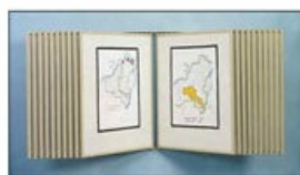
BEIGE FRAME FINISH WITH WHITE PANEL DIVIDER