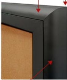
RADIUS EDGES on ALL 4 Sides Sleek and Contemporary Design