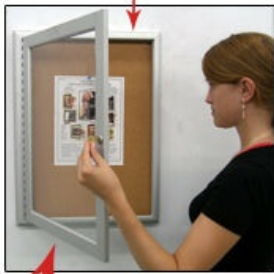
Frame Swings Open- Security Cam Lock On Front