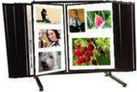
Keep your photos or posters together with the durable Table Top Photo Display