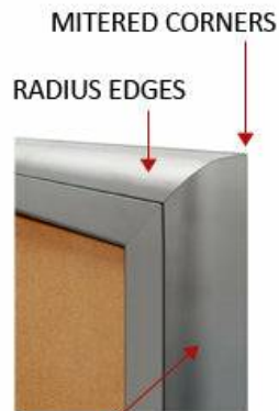
RADIUS EDGES on ALL 4 Sides Sleek and Contemporary Design