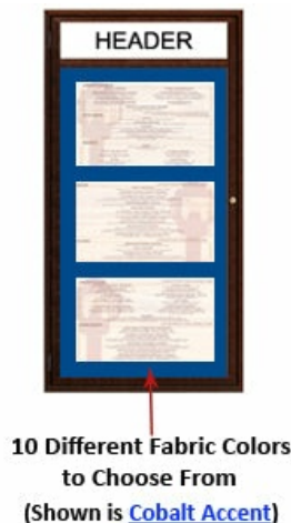
10 Different Fabric Colors to Choose From (Shown is Cobalt Accent )