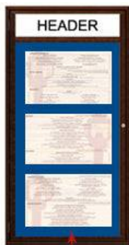
10 Different Fabric Colors to Choose From (Shown is Cobalt Accent )