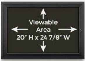
Outside Dimensions: 25" H x 36" W