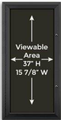
Outside Dimensions: 42" H x 21" W