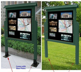
Comes with Base Plates