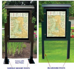
Comes with Base Plates SURFACE MOUNT POSTS