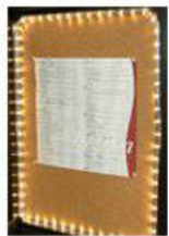
Full Perimeter LED Lighting