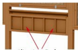
Literature Rack (comes with 5 Slots)