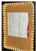
Full Perimeter LED Lighting