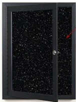
Long-Lasting BLACK Rubber Tackboard