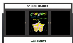
CONCEALED INTERIOR LIGHTING