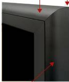
RADIUS EDGES on ALL 4 Sides Sleek and Contemporary Design