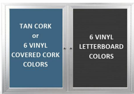
YOU CAN CHOOSE EXACTLY HOW YOU WANT YOUR COMBO BOARD TO LOOK!