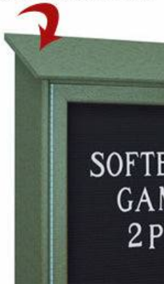
2" Letter Set Included