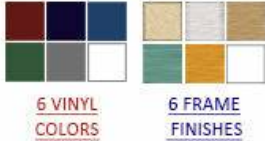
6 VINYL COLORS