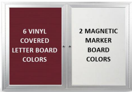
YOU CAN CHOOSE EXACTLY HOW YOU WANT YOUR COMBO BOARD TO LOOK!