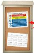
PORTRAIT & LANDSCAPE