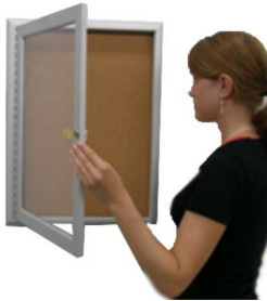
19 x 31 Radius Edge Enclosed Bulletin Board (PICTURES SHOWN, NOT TO SCALE)

FOR CURRENT PRICING, VISIT THE ID # LISTED ABOVE