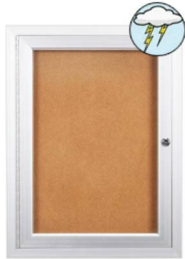
36" x 36" Enclosed Poster Case With Interior Lighting

FOR CURRENT PRICING, VISIT THE ID # LISTED ABOVE