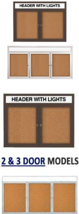
2 & 3 DOOR MODELS