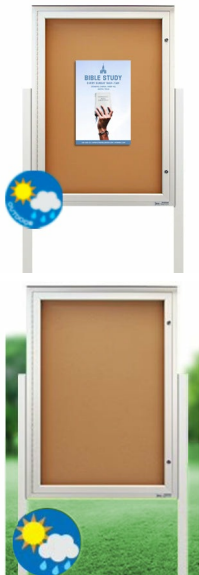
15+ Sizes - Portrait & Landscape