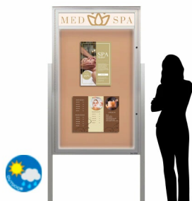
16+ Sizes - Portrait & Landscape