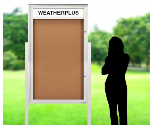
16+ Sizes - Portrait & Landscape