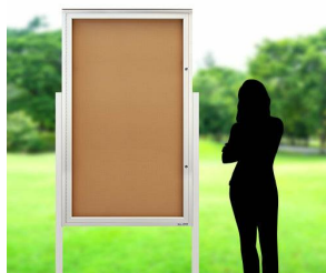
16+ Sizes - Portrait & Landscape