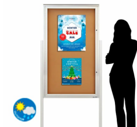
16+ Sizes - Portrait & Landscape