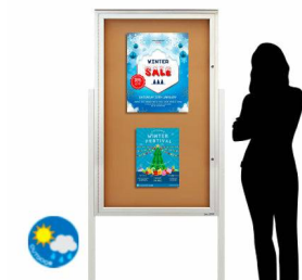
16+ Sizes - Portrait & Landscape