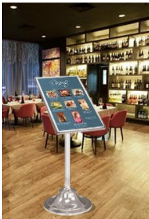
Weighted base holds up in high traffic areas