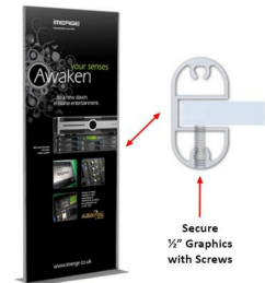
Secure 1/2" Graphics with Screws

*Either place (2) Poster Boards 1/4" Thick or Place (ONE) 1/2" Thick Poster Board. This will avoid any your posters from buckling or sagging.