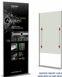
GRAPHIC INSERT CAN BE DISPLAYED AT ANY HEIGHT