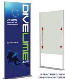
GRAPHIC INSERT CAN BE DISPLAYED AT ANY HEIGHT