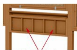
Literature Rack (comes with 5 Slots)