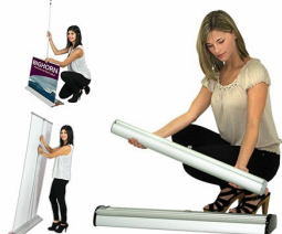
Drop-In Interchangeable Cassette for Quick & Easy Graphic Changes