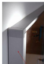
RIBBED ALUMINUM DESIGN (OVERALL DEPTH 1.375")