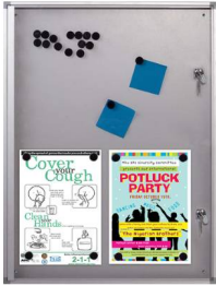
LOCKABLE FROM THE FRONT WITH 2 LOCKS & KEY SET