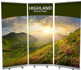
Set of Three (3) 31½" W x 78½" H Banner Stands Total Graphic Area of Approx. 97½" W x 78½" H