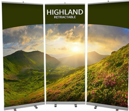
Set of Three (3) 31 1/2" W x 78 1/2" H Banner Stands Total Graphic Area of Approx. 97 1/2" W x 78 1/2" H