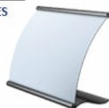
SILVER & BLACK FINISHES