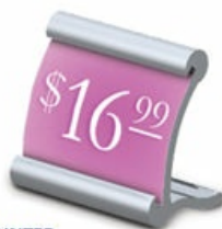
MOUNTED BASES COME IN