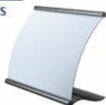
SILVER & BLACK FINISHES