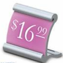
MOUNTED BASES COME IN