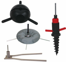
Variety of Optional Bases & Stakes