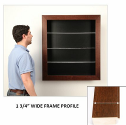
1 3/4" WIDE FRAME PROFILE