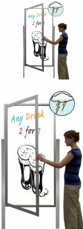
SECURITY CAM LOCK