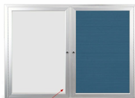
1 7/16" Wide Silver Door Frame