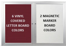
YOU CAN CHOOSE EXACTLY HOW YOU WANT YOUR COMBO BOARD TO LOOK!