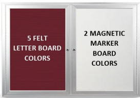
YOU CAN CHOOSE EXACTLY HOW YOU WANT YOUR COMBO BOARD TO LOOK!