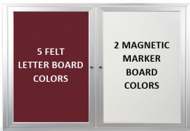
YOU CAN CHOOSE EXACTLY HOW YOU WANT YOUR COMBO BOARD TO LOOK!