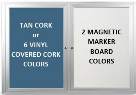
YOU CAN CHOOSE EXACTLY HOW YOU WANT YOUR COMBO BOARD TO LOOK!