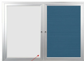
1 7/16" Wide Silver Door Frame