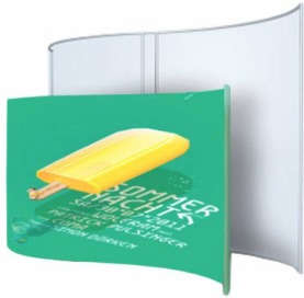
INTERLOCKING TUBES WITH SPRING BUTTON RELEASE, QUICK AND EASY ASSEMBLY

FOR CURRENT PRICING, VISIT THE ID # LISTED ABOVE