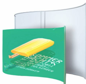
INTERLOCKING TUBES WITH SPRING BUTTON RELEASE, QUICK AND EASY ASSEMBLY

FOR CURRENT PRICING, VISIT THE ID # LISTED ABOVE