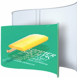
INTERLOCKING TUBES WITH SPRING BUTTON RELEASE, QUICK AND EASY ASSEMBLY