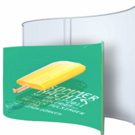
INTERLOCKING TUBES WITH SPRING BUTTON RELEASE, QUICK AND EASY ASSEMBLY