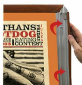
ALL FOUR SIDES SNAP OPEN