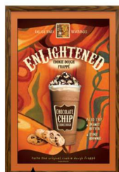
2" VIEWABLE MATBOARD

FOR CURRENT PRICING, VISIT THE ID # LISTED ABOVE